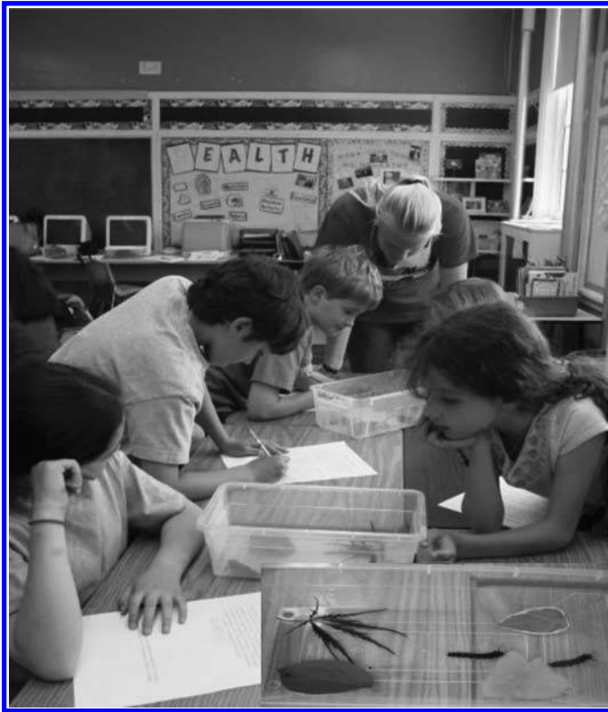
Figure 1. Third graders observing their caterpillars with four plant options (inset).

and 10 of the 16 larvae ultimately ate a leaf, with 100% of the feeding occurring on pipevine. The students were enthusiastic about observing their caterpillars, and surprised to find that although the caterpillars came into contact with all of the leaves, they ate only one kind of leaf. Students also noted that during the observation period the caterpillars were pooping, “kissing,” resting, and “fighting.”